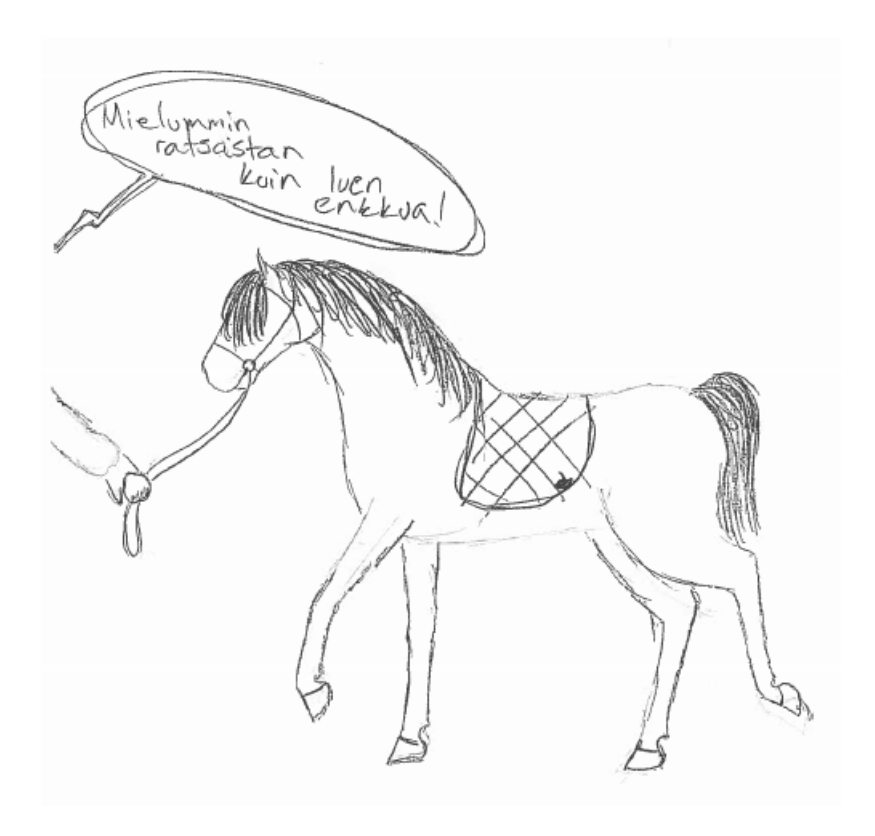
Figure 2. I'd rather ride than study English

In Figure 2, taken from the pupils' self-portraits as language learners, a passive fifth grader wrote in Finnish: I'd rather ride than study English! This reveals a contradiction in meanings the pupil gives for studying English and self-chosen free time activities.