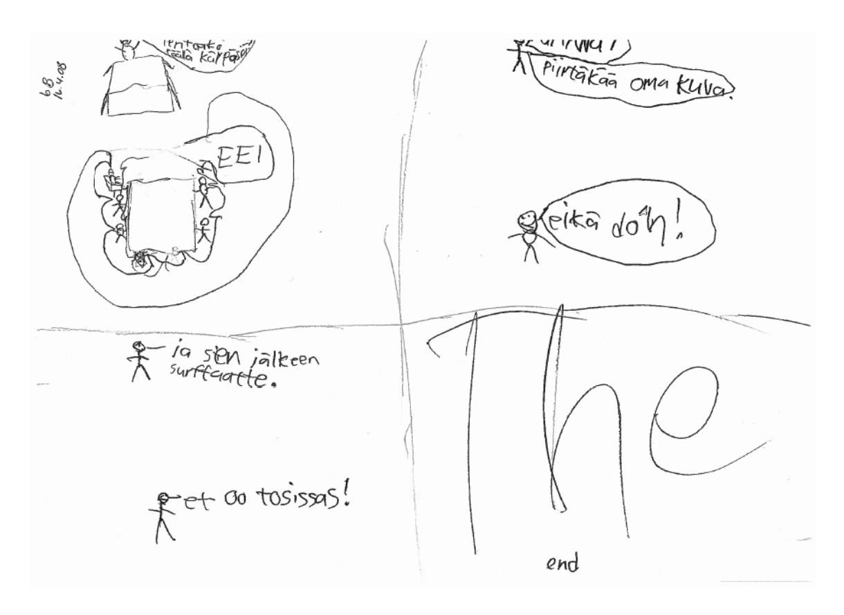
Figure 6. Are there flies flying about here?

In this self-portrait, the pupil expresses both his individual frustration and collective resistance targeted at the institutional norms of not disturbing the lessons and complying to teacher's instructions. This kind of resistance might have gone unnoticed in a classroom situation, but the comic strip made it visible because the genre allowed it.