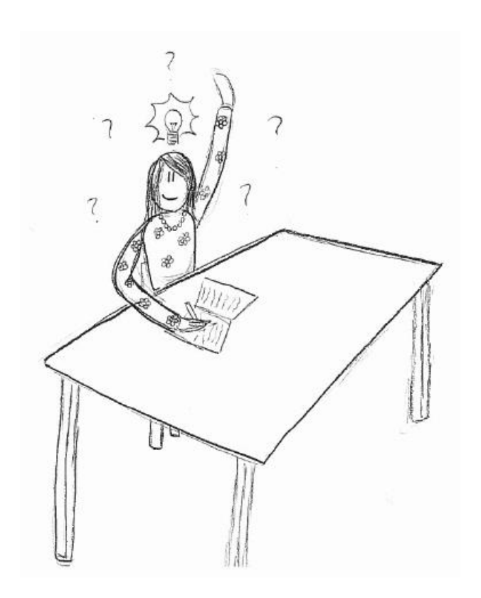
Figure 3. The "good language learner"

Speaking English and presenting positive orientation towards studying the language were seen as presentations of being a "good language learner". Especially the fifth graders reported about their interest in and enthusiasm about studying English. Some of them described themselves in the questionnaire as happy English learners, which suggests that they had positive attitudes towards studying the language. Although the sixth graders seemed less open about reporting their attitude, most of them regarded learning English as important. In spite of this, it was not always fun, which caused contradicting feelings and investment. For some pupils, the reluctance to express their opinion might have been affected by the fact that the researcher was also their teacher.