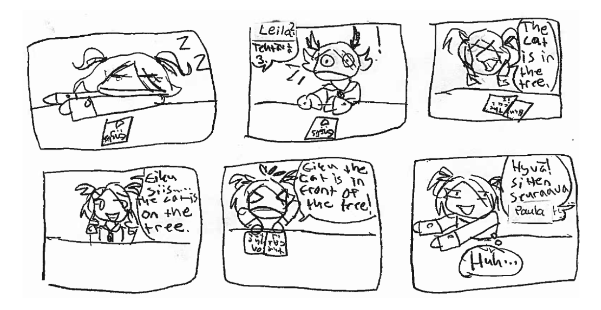
Figure 5. Phew...