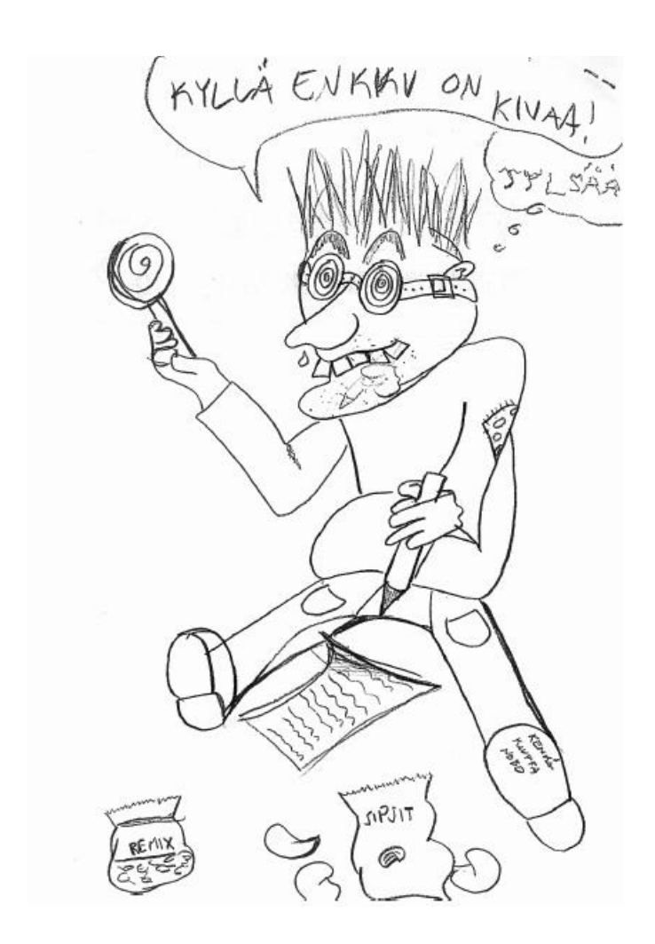
Figure 4. English is such fun! Boring

The drawings seemed to invite more ironical, ambiguous, and multi-voiced representations of being a learner than written questionnaires and interviews. This could be due to cartoon and comic strip styles that the pupils were familiar with.