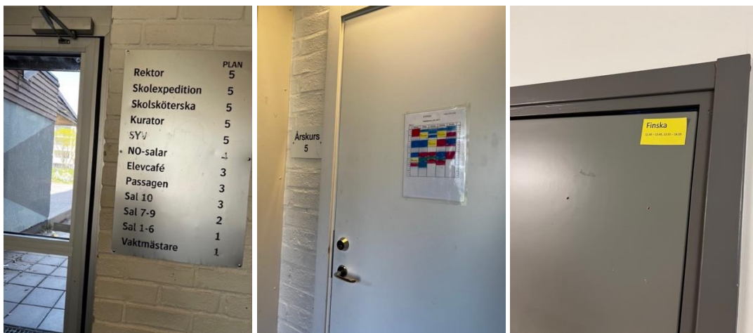
Figure 4: A permanent sign in Swedish identifying locations within the year 7–9 premises.

The entrances for years 7–9 differ from entrances 1 and 2 in that they do not include any signs in Finnish, Meänkieli, or Sami. Entrance 3 has no language-related images at all. Entrance 4 displays the school's Swedish-sounding name, painted in large letters, which is linked to the area where the school is located. A professionally produced metal sign provides information of the school's spatial arrangement (see Figure 4). The linguistics signal the permanent presence of Swedish, while Finnish, Meänkieli, and Sami are rendered invisible.