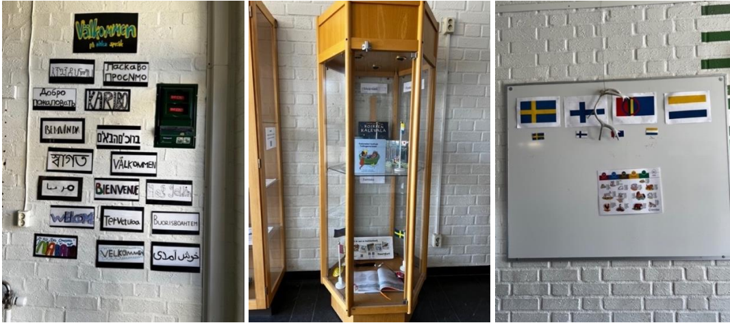
Figure 1: a collection of written texts making Finnish and/or Meänkieli, and Sami visible among several other languages.